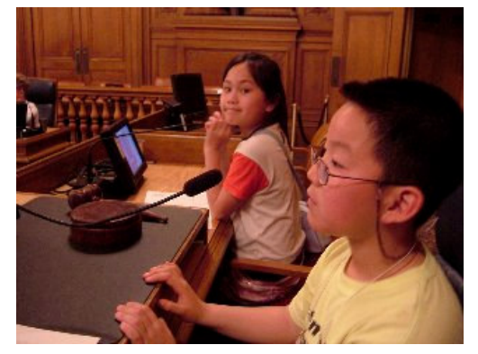
Students from Lawton Elementary School came to City Hall on May 15 and participated in a mock Board of Supervisors session and debated policy ideas surrounding restroom cleanliness.