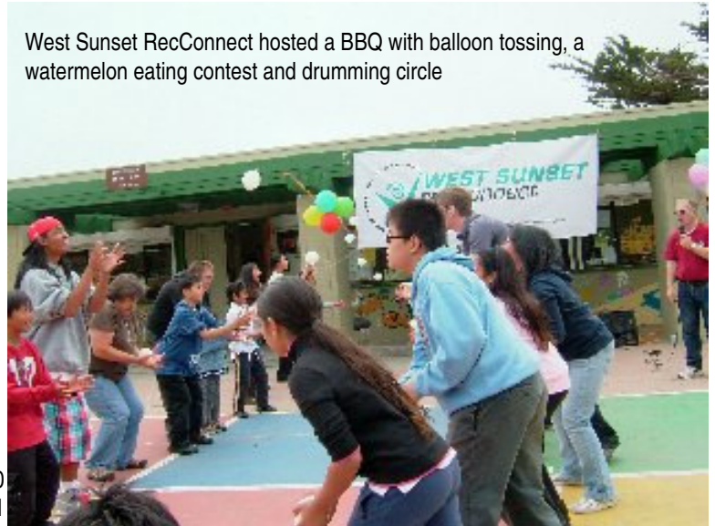
West Sunset RecConnect hosted a BBQ with balloon tossing, a watermelon eating contest and drumming circle