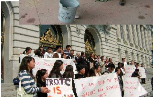
Supervisor Chu joined JROTC cadets at City Hall in support of preserving Physical Education credits for students who participate in the program