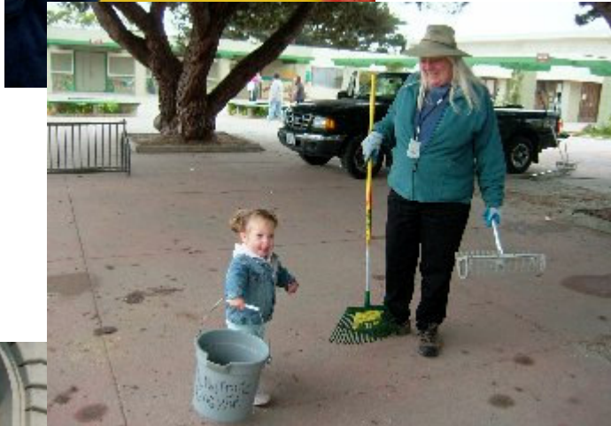
← Young volunteers help clean West Sunset Playground →