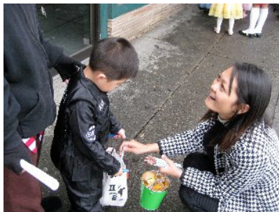
Taraval Merchants Trick-or-Treat