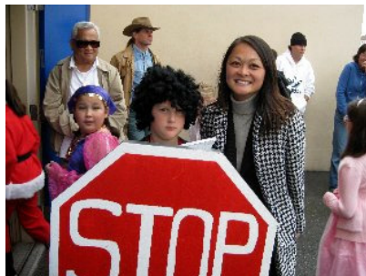
St. Gabriel School