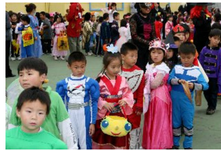
Ulloa Elementary School