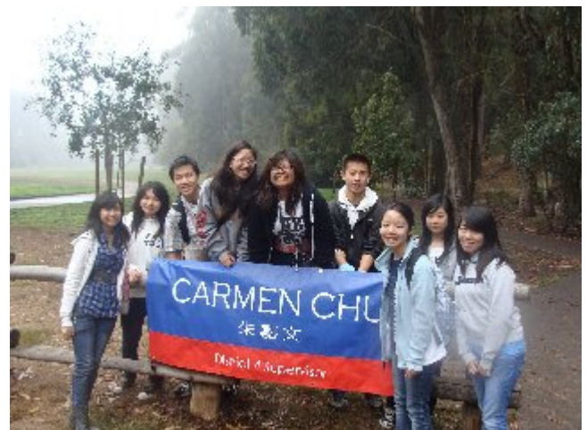
Student volunteers from Lincoln High School

Our next clean-up will be October 10 from 9 am – noon . For more information and to sign up, please call the office of Supervisor Chu at 415-554-7460.