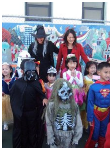
Students in costume at Lawton Alternative School