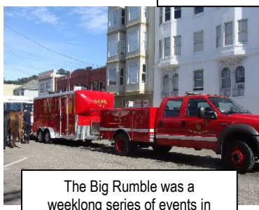
The Big Rumble was a weeklong series of events in memory of the Loma Prieta earthquake