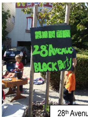
28 th Avenue neighbors (between Lincoln Way & Irving) held a block party on Oct. 17 th