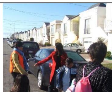
Supervisor Chu walked with students from Ulloa Elementary on Walk to School Day - October 7 th