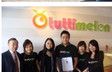
Tutti Melon at 2150 Irving Street celebrated its grand opening on October 24 th