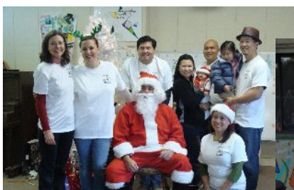
Members of FOWSP with Santa