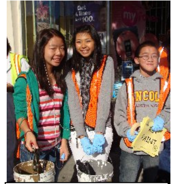
Students from Lincoln High School

DPW also steam cleaned the streets prior to the event. We would like to thank DPW and all of the volunteers who