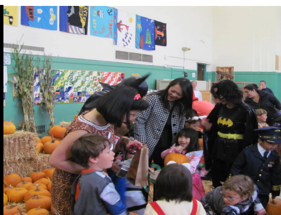
(Oct 29) Francis Scott Key has their very own pumpkin patch