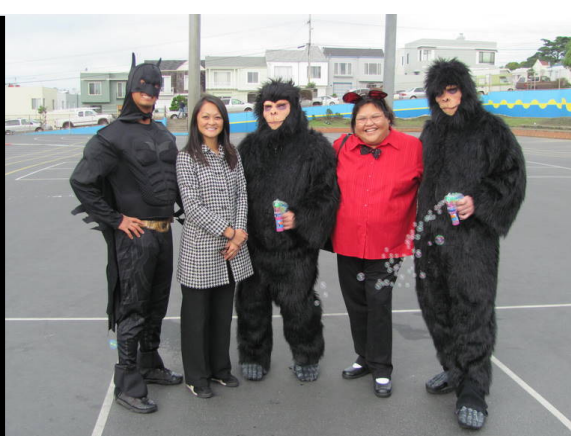
(Oct 29) Robert Louis Stevenson school officials get dressed up