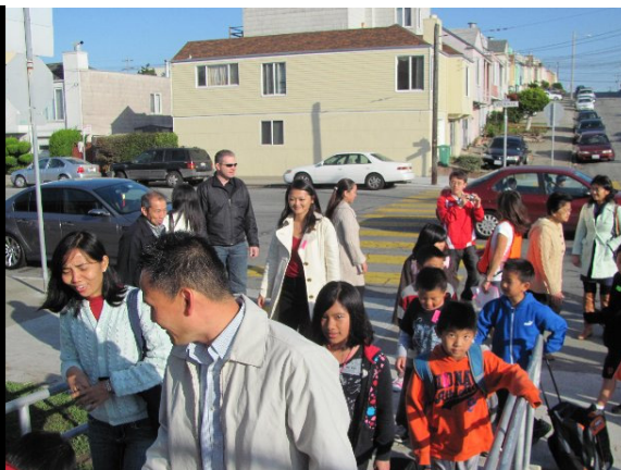
(Oct 6) Walk to School Day with Ulloa Elementary School students