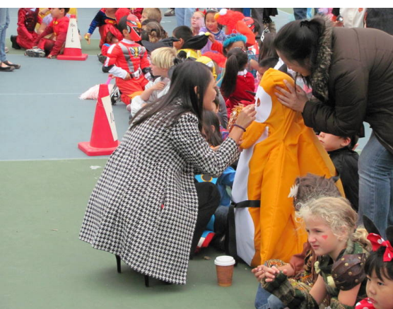
(Oct 29) Visiting students in costume at Sunset Elementary