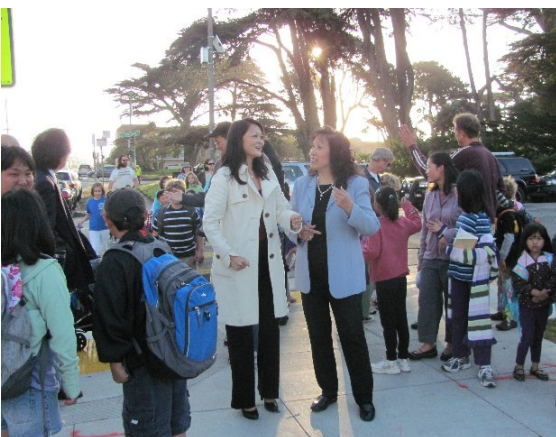
(Oct 6) Walk to School Day with Sunset Elementary School students