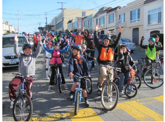
"U" is for Ulloa Elementary School students!