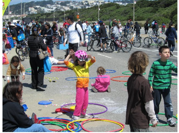
The sun came out for Sunday Streets on April 10 at the Great Highway.