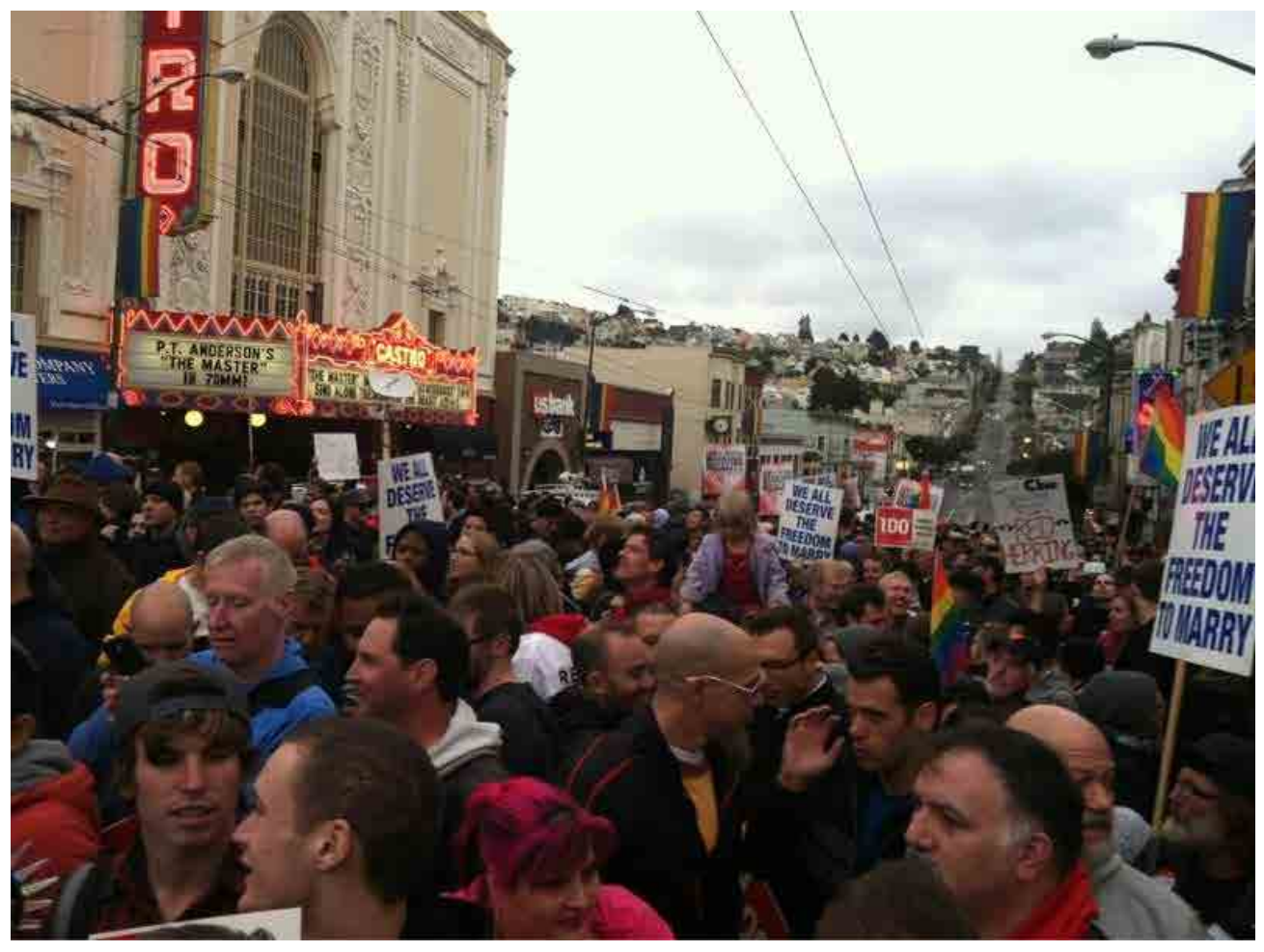
Crowd gathered at Castro and Market for the Marriage Equality March