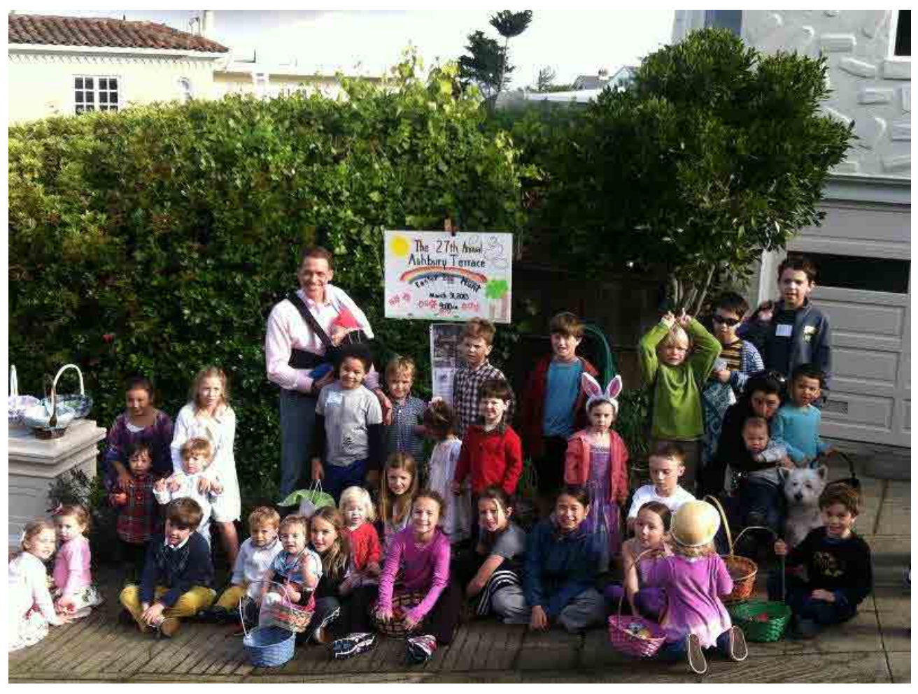
Neighborhood kids enjoying the 27th Annual Ashbury Terrace Easter Egg Roll

The Glen Park Farmers' Market runs every Sunday from March 31st to November 24th. Click <u>here</u> for more information.