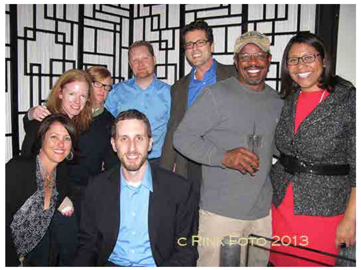
Scott with friends, including Supervisor London Breed, at his birthday.

chaotic and opaque CEQA appeals process by setting clear and predictable timelines for filing appeals, continues to go through the legislative process as it works its way towards the full Board of Supervisors. My legislation has broad support from various goodgovernment, neighborhood, transit, affordable-housing, and labor organizations. It has also been endorsed by the <u>San Francisco</u> <u>Chronicle</u>, the <u>San Francisco Examiner</u>, and the <u>Bay Area Reporter</u>. Both the Planning Commission and Historic Preservation Commission have recommended it. The legislation will be heard at Committee next week, and at that point Supervisor Kim's alternate legislation will also be ripe for a vote. At that point, with both measures before the committee, I'm hopeful that a decision will be made on which legislation to send for the Board for a vote.