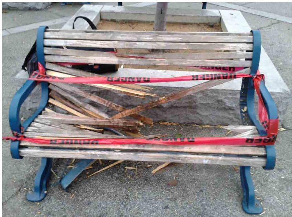
An example of vandalism in our parks: a destroyed bench in Portsmouth Square

Currently, our municipal code - unlike other major American cities - does not set any park hours, which has led to a patchwork of informal park hours that are inconsistent and very difficult to enforce. This lack of enforceable closing hours has led to a significant problem of nighttime vandalism, metal theft, and dumping in our parks. Last week at the Board of Supervisors, I introduced legislation establishing a uniform statutory rule that all parks are open between the hours of 5:00 a.m. and midnight (i.e., closed from midnight to 5 a.m.), with an exception for the use of any road or adjacent sidewalk for the purpose of traversing the park. San Francisco is the only major American City without established park hours -- New York, Chicago, Los Angeles, Austin, Portland and Seattle, just to name a few, all have park closing hours for a five to seven hour period at night. The Recreation and Park Department estimates that vandalism and illegal dumping in City parks, almost all of which occurs at night, cost the city nearly $1 million a year in staff costs and maintenance expenses. By establishing park closure hours, Park Patrol and the Police will have another tool to fight against these kinds of property crimes that cost our city valuable resources to repair and remove.