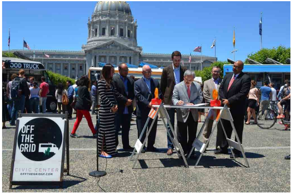
Mayor Ed Lee signs Scott's Food Truck legislation at the Civic Center Off the Grid