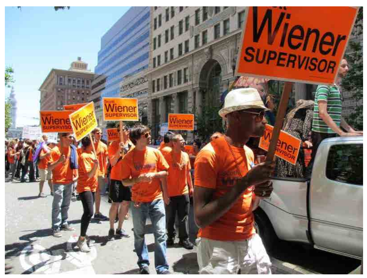
Scott's contingent marches up Market Street for the 2012 Pride Parade.