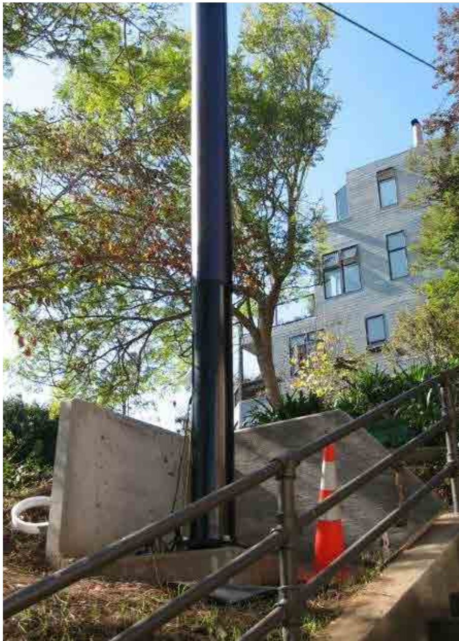
The new lighting on the Saturn Steps