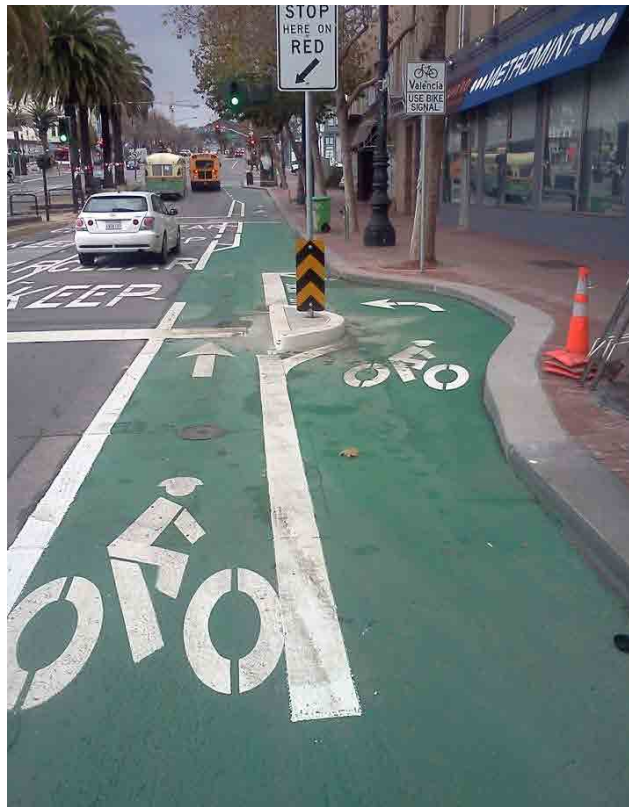
The new left turn lane at Market and Valencia