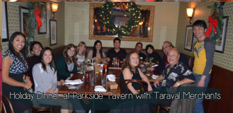
Holiday Dinner at Parkside Tavern with Taraval Merchants