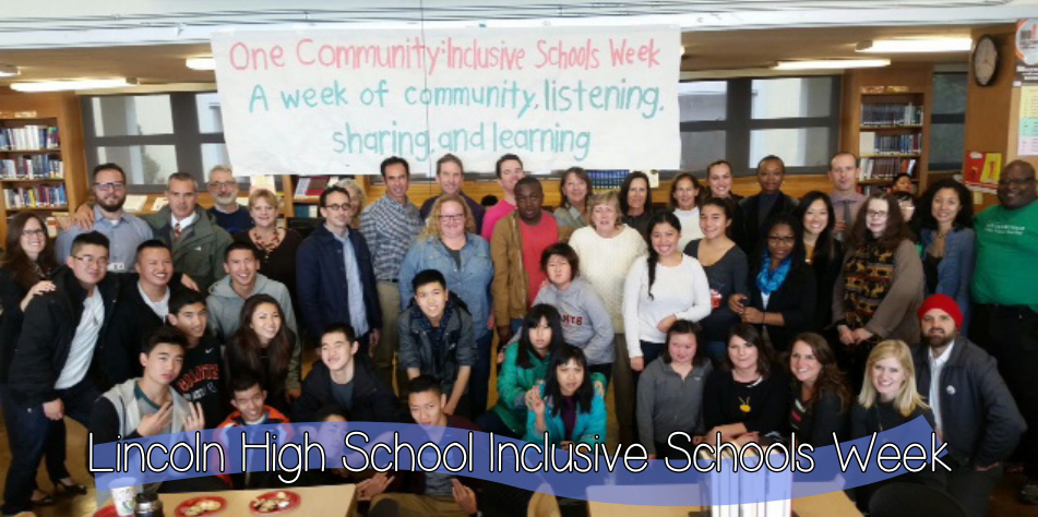
Lincoln High School Inclusive Schools Week