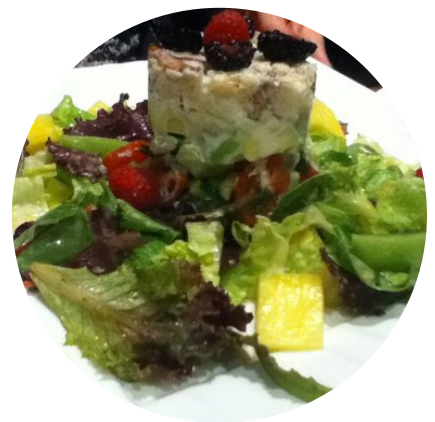
Meals offered at S&E Cafe include (from left to right): Orange Duck, Porridge, and Crab Meat Salad.