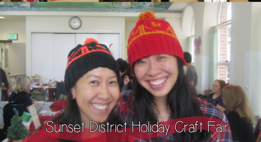
Sunset District Holiday Craft Fair