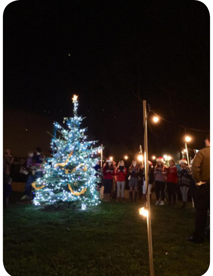
Tree Lighting at McCoppin Square.

Visit Henry's House of Coffee at www.coffeesf.com