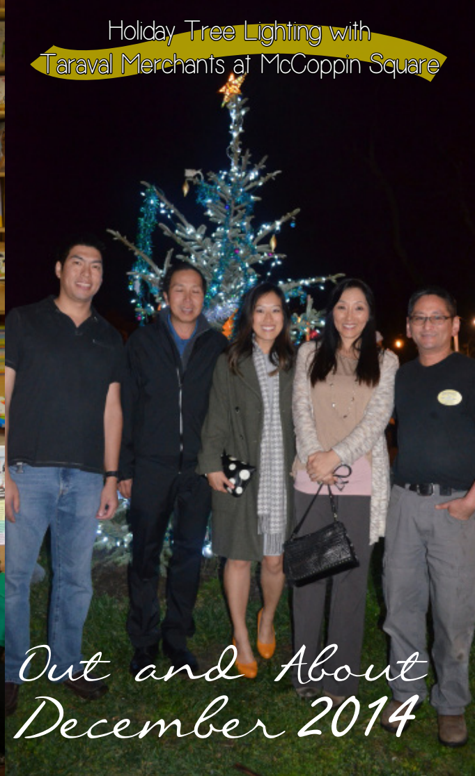
Holiday Tree Lighting with Taraval Merchants at McCoppin Square