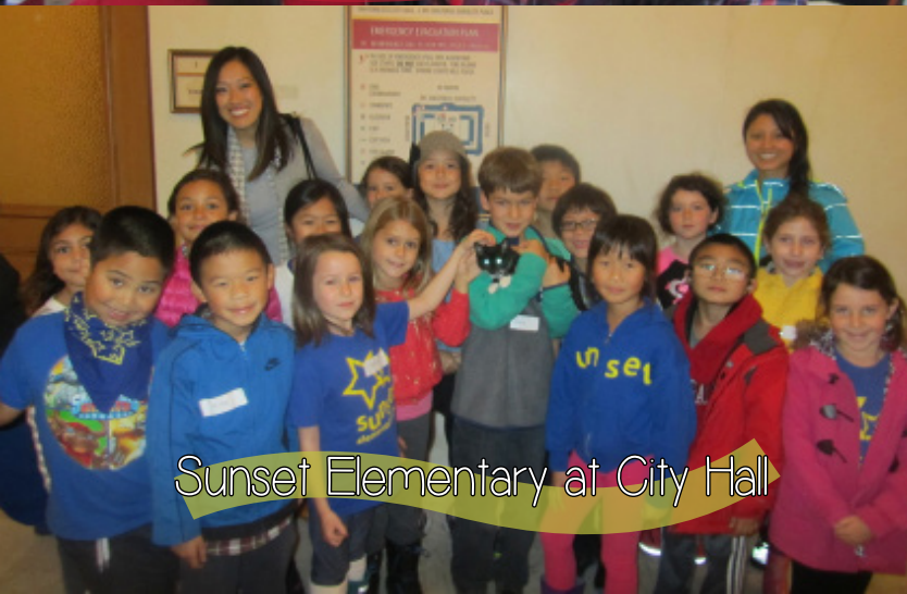
Sunset Elementary at City Hall