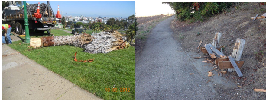
Examples of vandalism in Dolores Park and McClaren Park