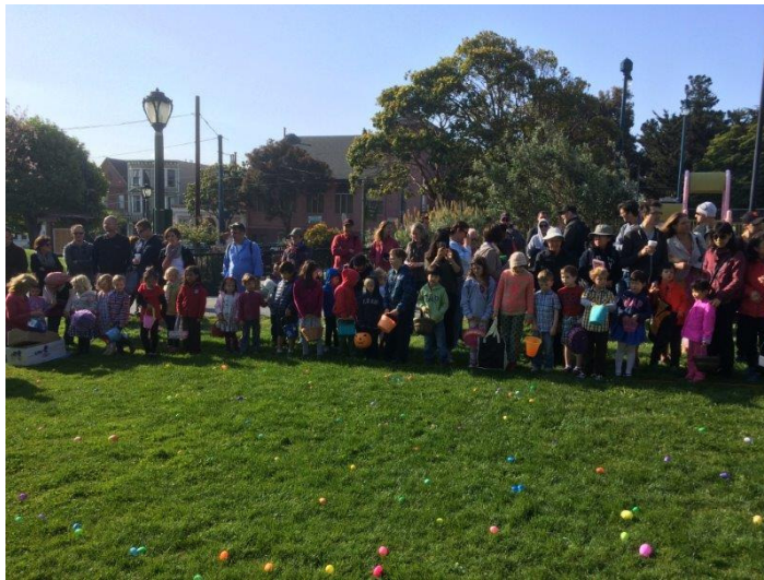
Kids lined up for the Duboce Park Easter Egg Roll

Do you like to help tourists find their way and learn about the Castro? Join the Castro Ambassadors. The Castro Ambassadors are a great group of volunteers who share their knowledge of the neighborhood with visitors from all over the world. We ask for a minimum commitment of 4 hrs./month. Being an ambassador is a great way to give back to the community, meet new friends and have fun! Interested? Go to: http://www.castrocbd.org/index.php/our-services/castro-ambassador to sign up.