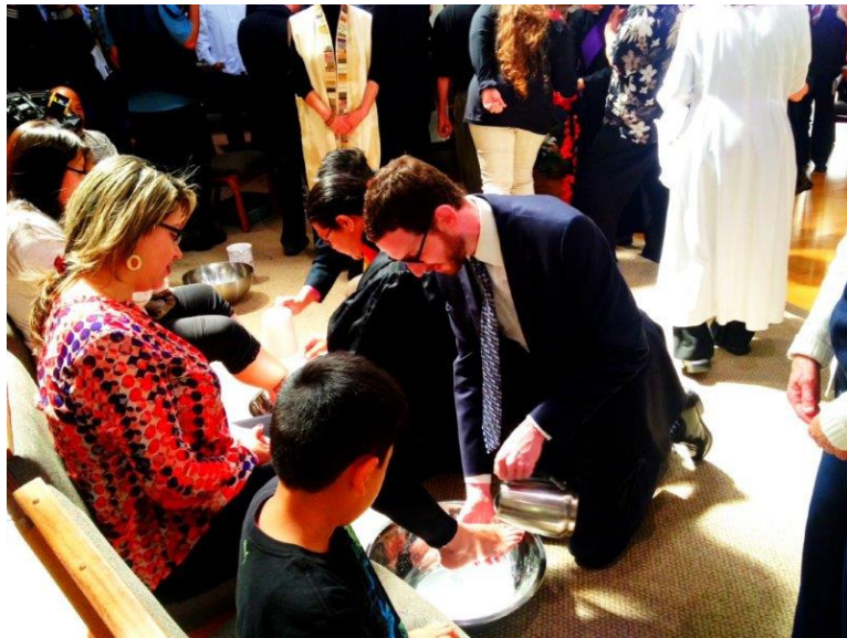
At St Johns Episcopal Church with Nancy Pelosi and labor and community leaders washing feet of undocumented immigrants at risk of family separation