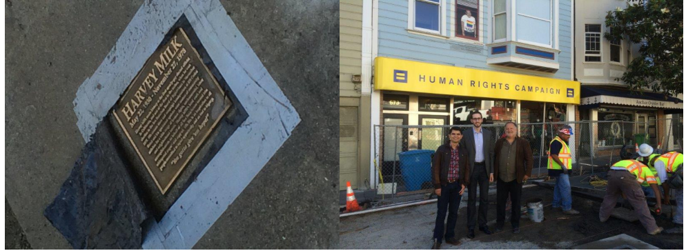
Putting the Harvey Milk plaques back in the sidewalks