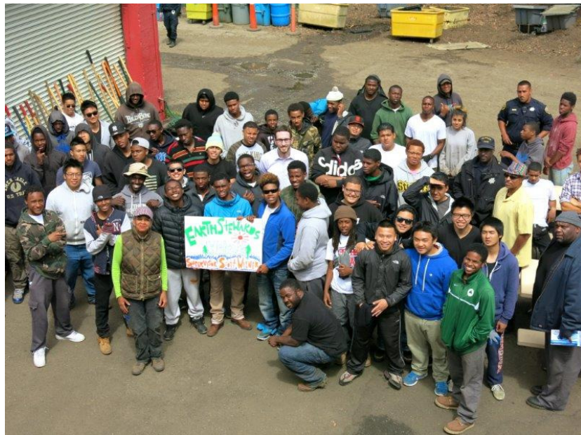
Scott at the Garden Project

After opening the park, it came to the attention of the Recreation and Park Department that the slope of the tennis courts are not in line with current USTA recommendations. The Department has reviewed all tennis courts now in construction and design to ensure that they are in line with USTA recommendations. The plan is for the repair work to begin by the end of September or early October, with notice to all parties in advance. The playground is expected to be open during that time. Check here for updates as well.