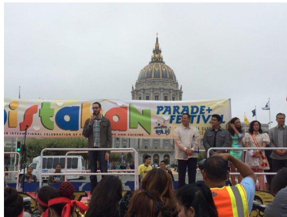
Scott speaking at the annual Pistahan Parade and Festival with Assemblymembers Phil Ting and Rob Bonta, and others

Muni's light rail vehicles - which are few in number and prone to breakdowns - are the top source of lack of reliability in the system. They cause daily havoc for riders, leading to gaps in service and significant over-crowding. Replacing and expanding the light rail fleet is a top priority. Last week, the Board of Supervisors approved the purchase of the next generation of light rail vehicles from Siemens. These badly needed new LRVs will replace the current defective fleet, while also expanding the size of the fleet significantly. Approval of this contract is a big step forward for our city. Now we need to ensure that it's fully funded over time. The first new vehicles will come online in 2017 , with continued rollout thereafter. We need to do everything in our power to accelerate the rollout.