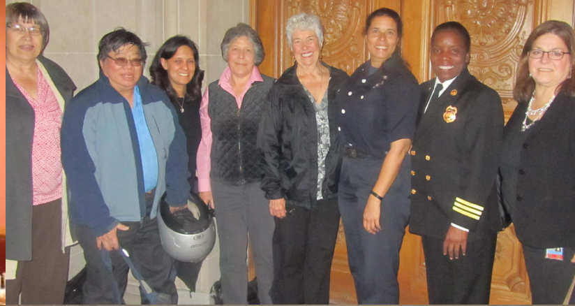
Far Out West Garden Volunteers won the Best Green Community Project at the Neighborhood Empowerment Network (NEN) Awards