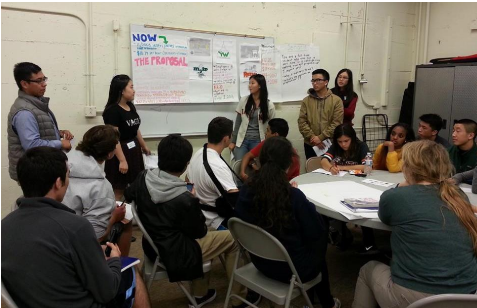
YC'ers facilitating Minimum Wage workshop at Young Voter's Forum

YC and BOS passed respective resolutions in 2005 Strong youth participation in November 2014 ballot issues Successful 2014 Young Voters' Forum at Balboa HS