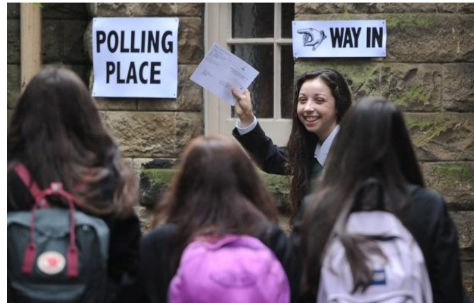
Youth turnout in force during Scottish referendum

•85% 16-17 year old turnout in 2014 Scottish referendum •Senator Leno co-authored state constitutional amendment to allow 17 year olds to participate in primary elections