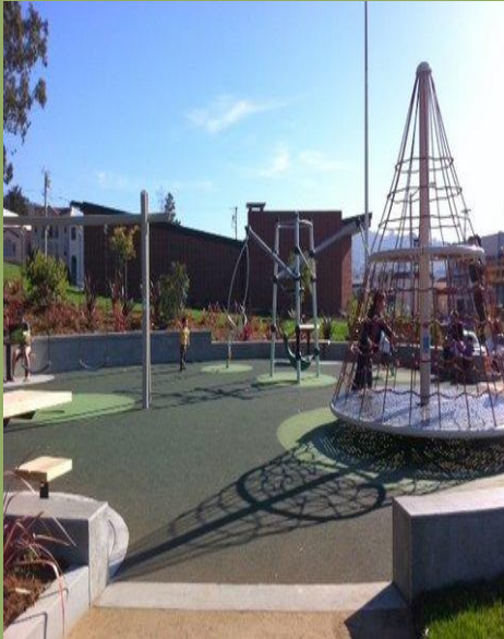
The new McCoppin Square Playground

In 2008, the voters of San Francisco passed the "Clean & Safe Neighborhood Parks Bond", which resulted in $185 million capital improvement projects in our City parks and open spaces. The Sunset benefitted quite a bit from the 2008 Bond. McCoppin Square was completely renovated, the new and improved Sunset Rec Center and Playground will be finished in September 2012, and the Parkside Square and Larsen Park will have new restrooms this summer. However, there are still many areas that need work in District 4 and we need your feedback on areas that are important to you.