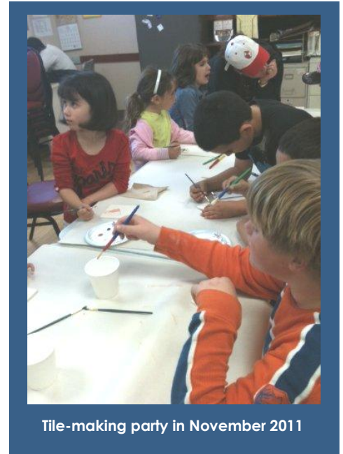
Tile-making party in November 2011